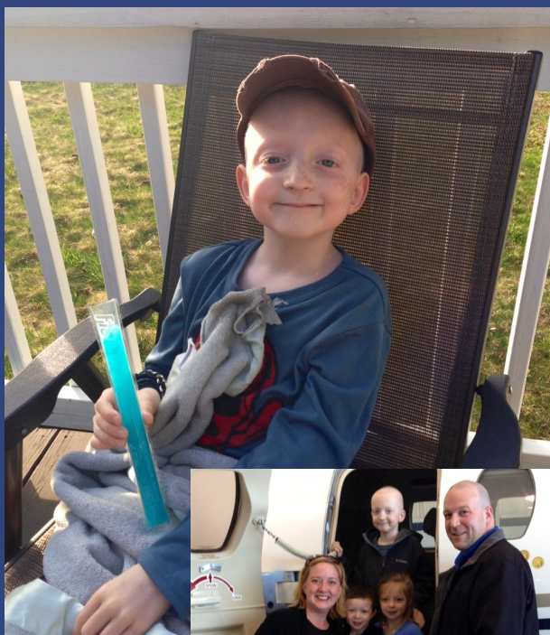
The Grimes Family